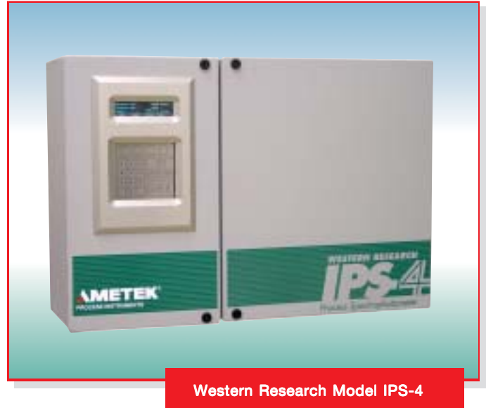
Western Research Model IPS-4

This combination offers many advantages such as no moving parts, a high signal-to-noise ratio, minimized stray